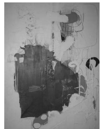
Painting by Ed Wallace